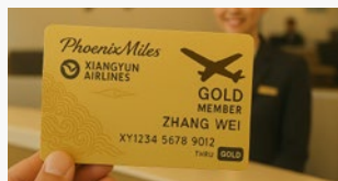
Premium Membership Cards